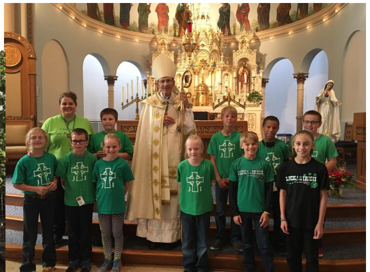
Cathedral in New Ulm—Fourth Graders