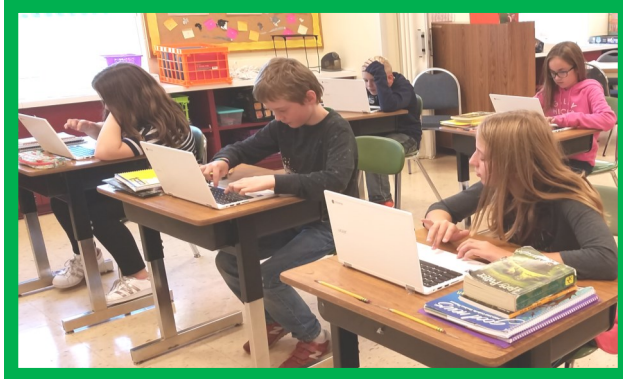
One-on-one Chromebooks for all subject areas

Fully Accredited School, Certified Staff, Exceptional Technology, Music, & Phy-ed Classes, Choir and Band Programs, Library, Student Focused Curriculum