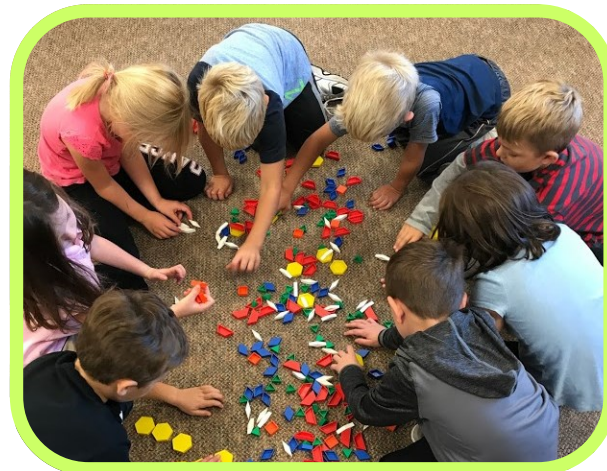
Teamwork! Counting, Sorting, and Creating Patterns