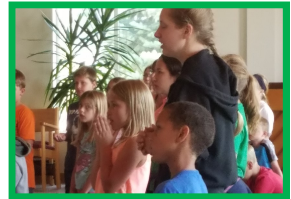
Praise and Worship Adoration as part of our All School Retreat