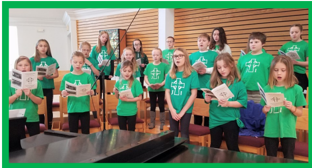
John Ireland School Choir