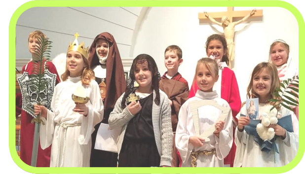
Saints Presentations for All School Prayer Service

Weekly Mass and Prayer Services, Adoration, Religion Classes, Faith Enriched Curriculum, Each day begins and ends with Prayer